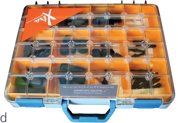
product may differ to photo

Designed to make life easier for installers and service engineers! With compartments chosen by you, this really is an essential piece of kit to have near. The toolbox comes with an illustrated guide on an outer card die-cut case, plus refill information.